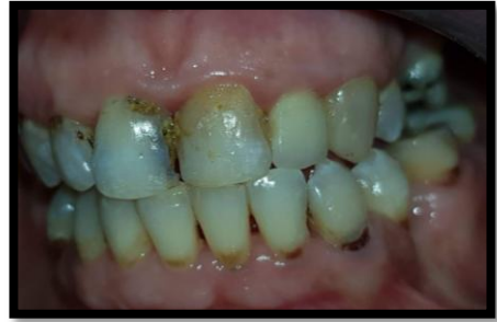
Pre – operative