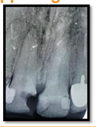
Upper right 1