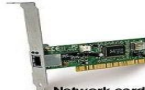
Network card NIC